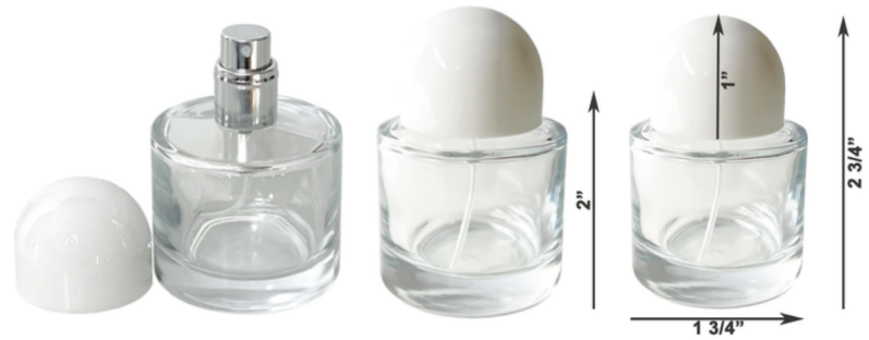
2. White Half Circle Cap