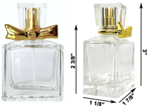
3. Gold Bow