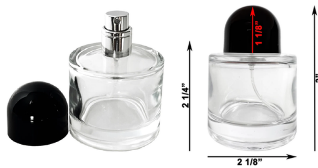
6. Black Half Circle Cap