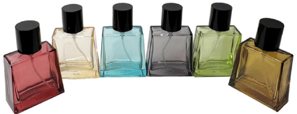
4. Colored Glass Square