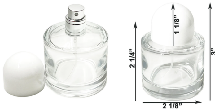
5. White Half Circle Cap