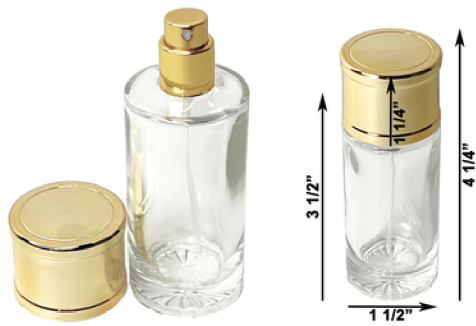
1. Gold Cylinder