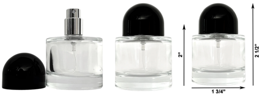
1. Black Half Circle Cap

$20/each + $35 for name OR date engraving $20/each + $55 for name AND date engraving