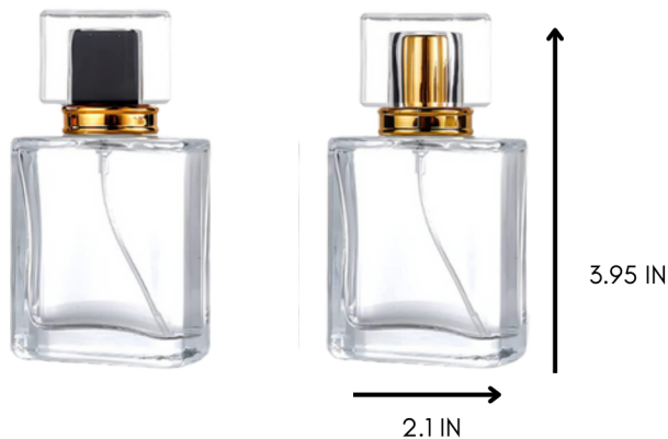
7. Black or Gold Square