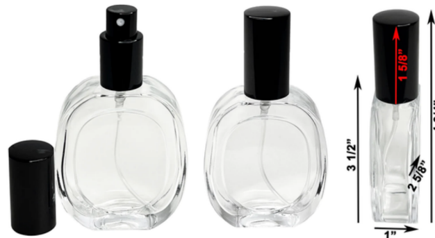
4. Black Oval (also available in 30 ML)