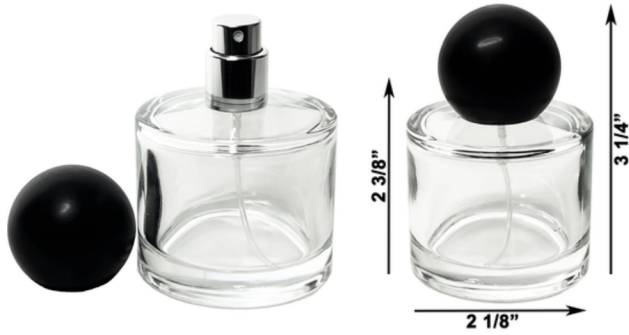
3. Black Ball Cap