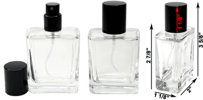
2. Black Square